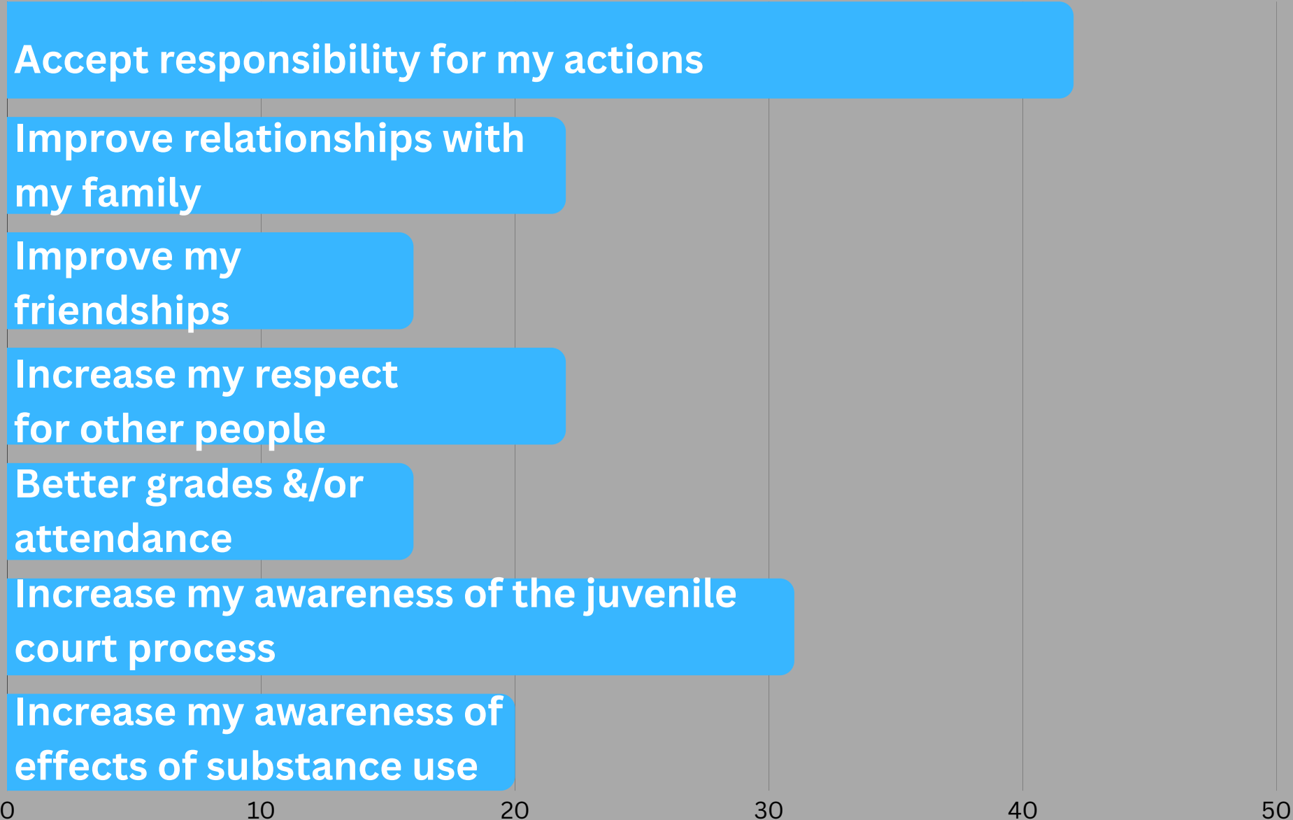
Maximum 44 responses, multiple answers were allowed

I FEEL MY PARTICIPATION IN TEEN COURT HELPED ME TO DO THE FOLLOWING: