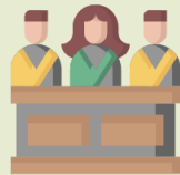
CASE IS HEARD BY TEEN PANELISTS

Panelists interview both respondents and their parent/guardians. Sanctions are customized for each person.