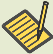
TEXT, EMAIL OR DROP OFF

Get forms to Oneida Extension Office within 1 week