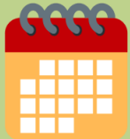
CASE IS SCHEDULED

Cases are heard one of 3 ways: - At courthouse in person - On campus in person - Over zoom