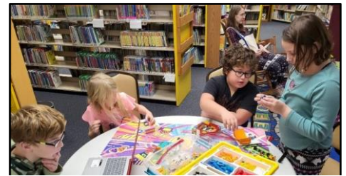
A team of 4-Hers work on creating their team model as part of the Oneida County 4-H LEGO Robotics "Explorers" program held each week at the Rhinelander District Library.