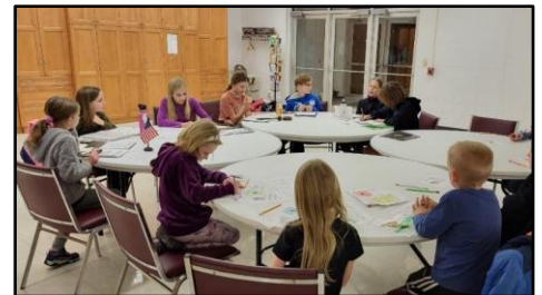
Members of the Northwoods Explorers 4-H Community Club practice using Robert's Rules of Order while discussing club business during their November gathering.