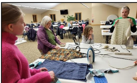
4-H youth participants in the "Learn to Sew" program learn from local caring adult volunteers how to make an apron.

Right: An Oneida County 4-H member shows off her finished fabric coaster made during the first session of Oneida County 4-Hs "Learn to Sew!" program held in Minocqua.