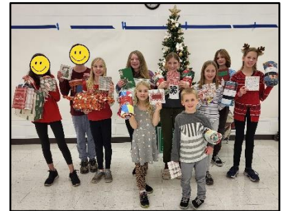
Instead of planning a gift exchange for each other, youth members of the Northwoods Explorers 4-H Club brought donations for local nursing home residents. The club members then met at the nursing home the following week and handed each resident in the memory care unit a blanket gift and homemade holiday card. They also sang a song.